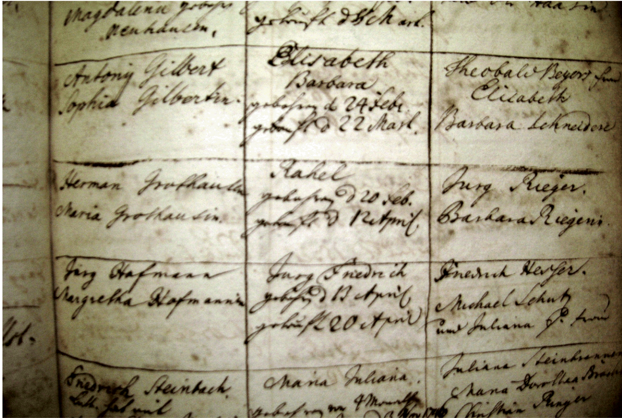
The Second Complete Entry:

Original Page 79; by later enumeration, Page 77; the year 1747