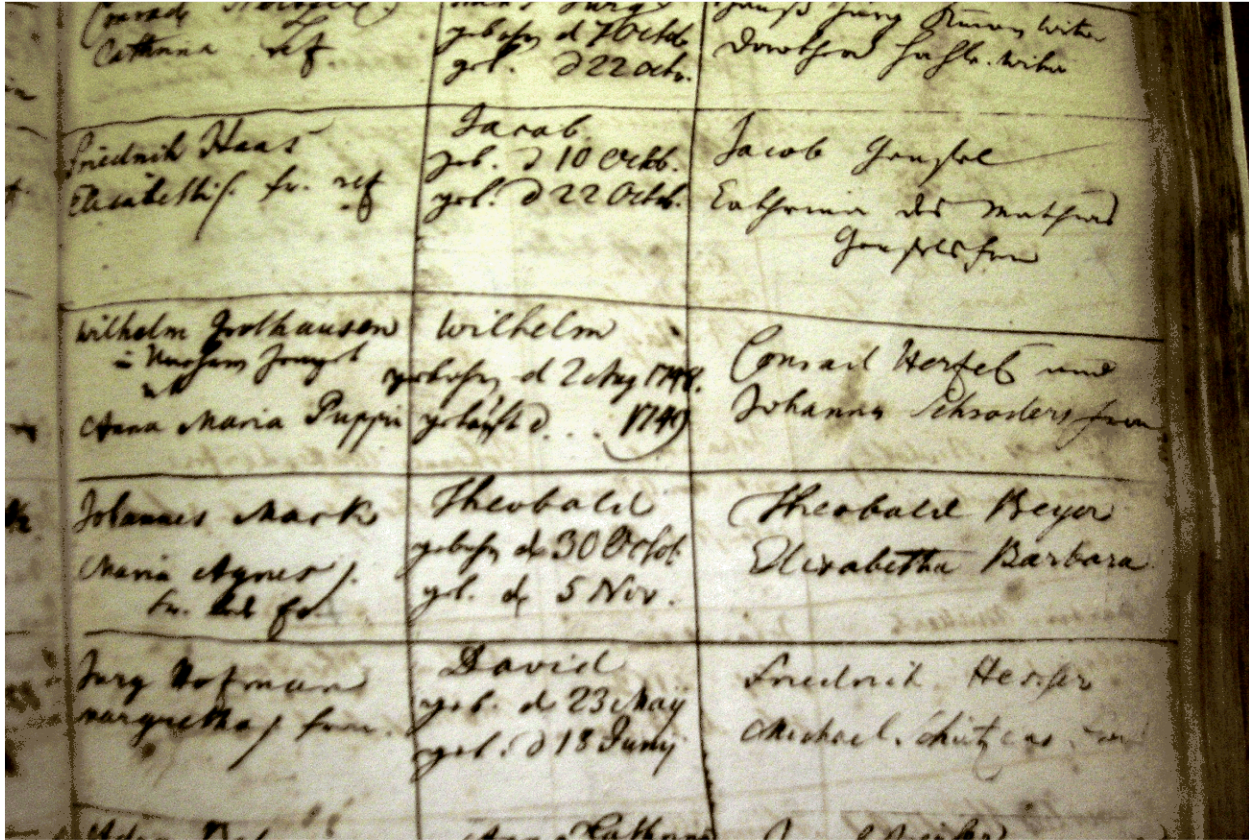
The Second Complete Entry: